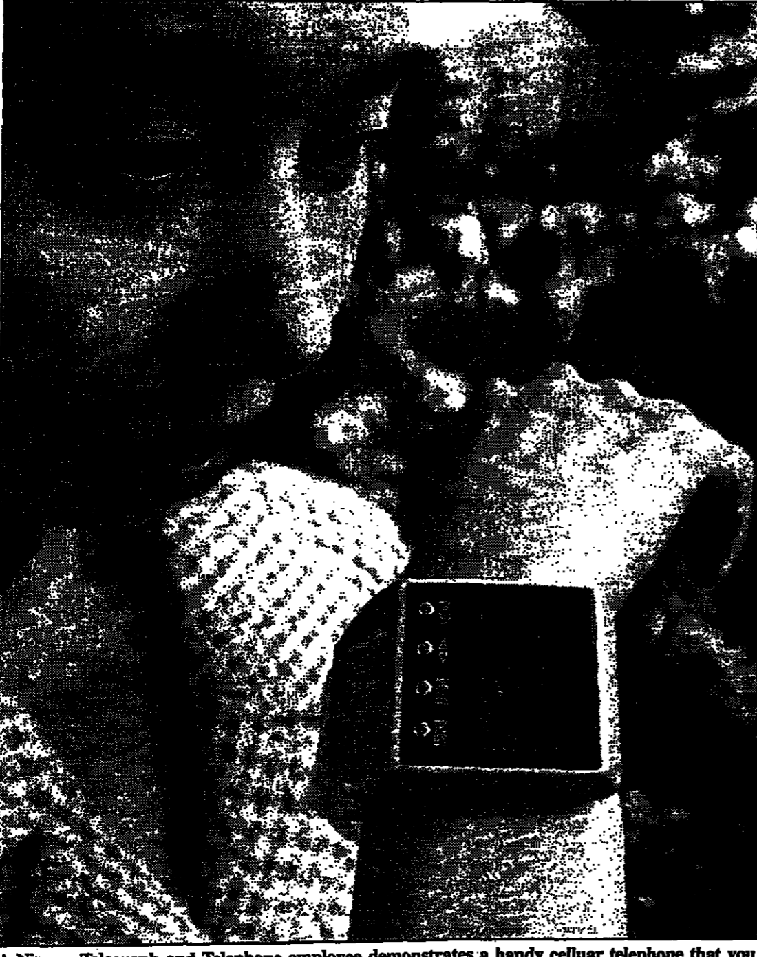
A Nippon Telegraph and Telephone employee demonstrates a handy cellular telephone that you wear on your wrist. Its dialing controls are all voice-activated, so no numerical keypad is necessary. The company says it hopes to market the wrist phone within two years, at a retail price of just under $500. No word on whether it also can tell time.

The weather is perfect for picking. The grapes are sweet and juicy. They are perfect for eating or for making juice. They are perfect for eating or for making juice.